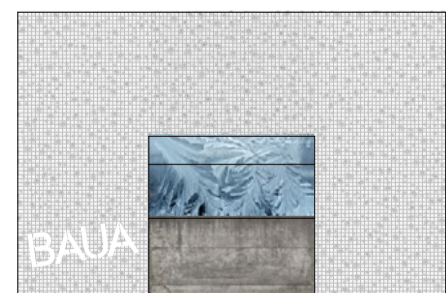
side view scale 1_50